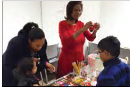
Friday Samplings: Scenes from the NTP and Cultural Affairs Holiday Crafts event at the Benjamin J. Dineen, III & Dennis C. Hull Gallery on Dec. 2.