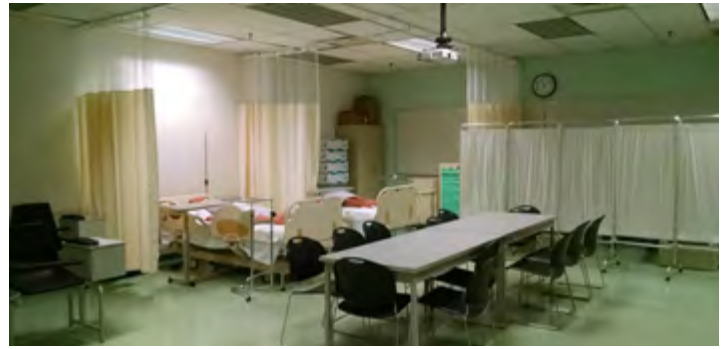
The finished Health Skills Lab located at the Cundari Center.