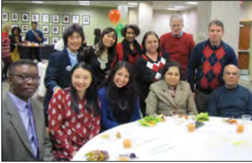
The 3rd Annual Adjunct Appreciation Night was held on Wednesday, December 7, 2016, where over 40 Adjunct Faculty Members and others staff members came together to share stories about the semester with other faculty, deans and Hudson County Community College leadership.