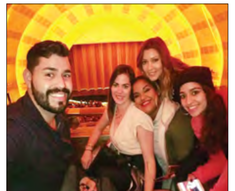
Learning Community student winners enjoying their prize at the Radio City Music Hall.

The Poster Presentation titled "Black Swan" was selected the Best Poster by the attendees at the Fall 2016 Learning Community Day, during the Poster Session that showcased LC Students' best work from their LC classes. The winners were from the ESL Learning Community, which links ESL Reading IV and the college level course, Introduction to Psychology. The students completed this poster as a part of the research project focusing on "Finding Psychology in Movies," for their Psychology class. The winners of the Best Poster received tickets to the Radio City Music Hall Christmas Spectacular. The LC students were excited that they won the Best Poster award, and they felt thrilled when they visited Radio City Music Hall.