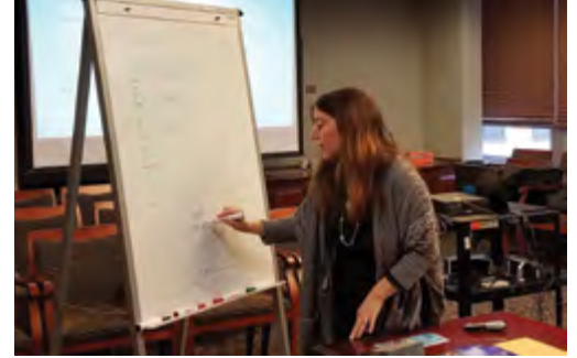
The presenter pictured above was conducting a workshop entitled "The Power of Positive Thinking". A group of HCCC Faculty & Staff learned how to effectively use positive affirmations to harness the power of positive thinking every day.