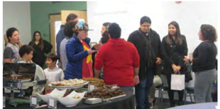
Faculty, students, and members of the community socialize and sample various holiday foods and drinks.