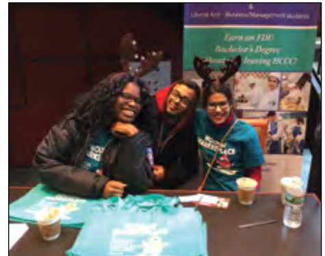
Scenes from the HCCC Holiday Marketplace on Dec. 10, 2016 at the Culinary Conference Center.