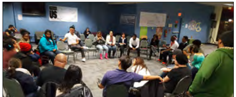
Students reflected on the 2016 presidential election during an open discussion.