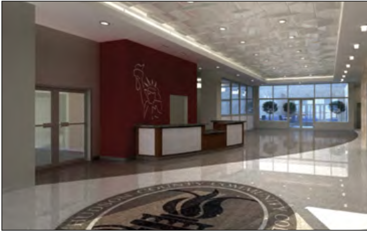
The lobby of the STEM Building measures approximately 1,500 square feet. It features terrazzo floors, stone detail walls, and a coffered ceiling with light pockets.

Hudson County Community College's STEM Building is scheduled to open in the fall of 2017. Its amenities will include six Computer Labs, as well as dedicated laboratories for Organic Chemistry; Science; Chemistry; Engineering; Microbiology; Electric (for computer technology and electronics engineering technology courses); Physics; Biology; and Histology. In addition, the labs will be equipped with emergency showers, secure clean rooms, and secure prep rooms.