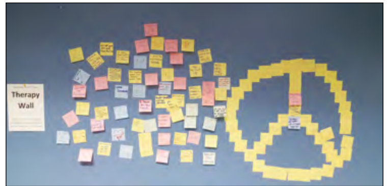
Therapy Wall at 25 Journal Square.