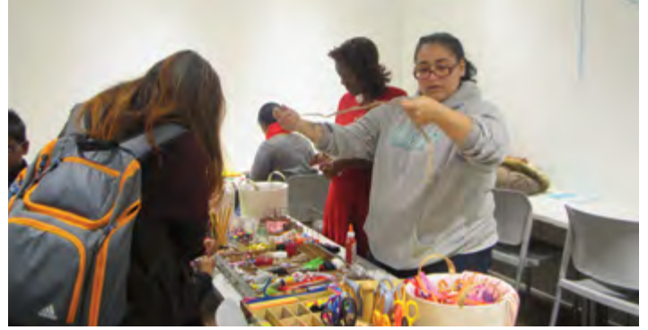
Students create Christmas ornaments in the crafts room.