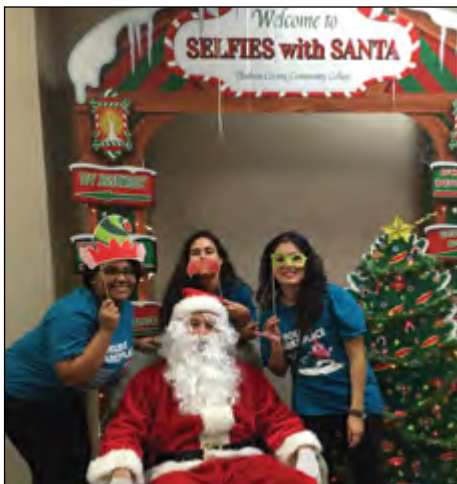
Scenes from the HCCC Holiday Marketplace on Dec. 10, 2016 at the Culinary Conference Center.