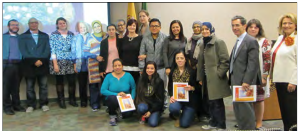
Students, faculty, staff, and administrators gathered on Nov. 9 for the publication premiere of the 27th edition of Diversity , a literary magazine compiling written work by HCCC's ESL students.

We saw the white bears. We took photos of the white bears. It was very nice sightseeing because everything was in white color.