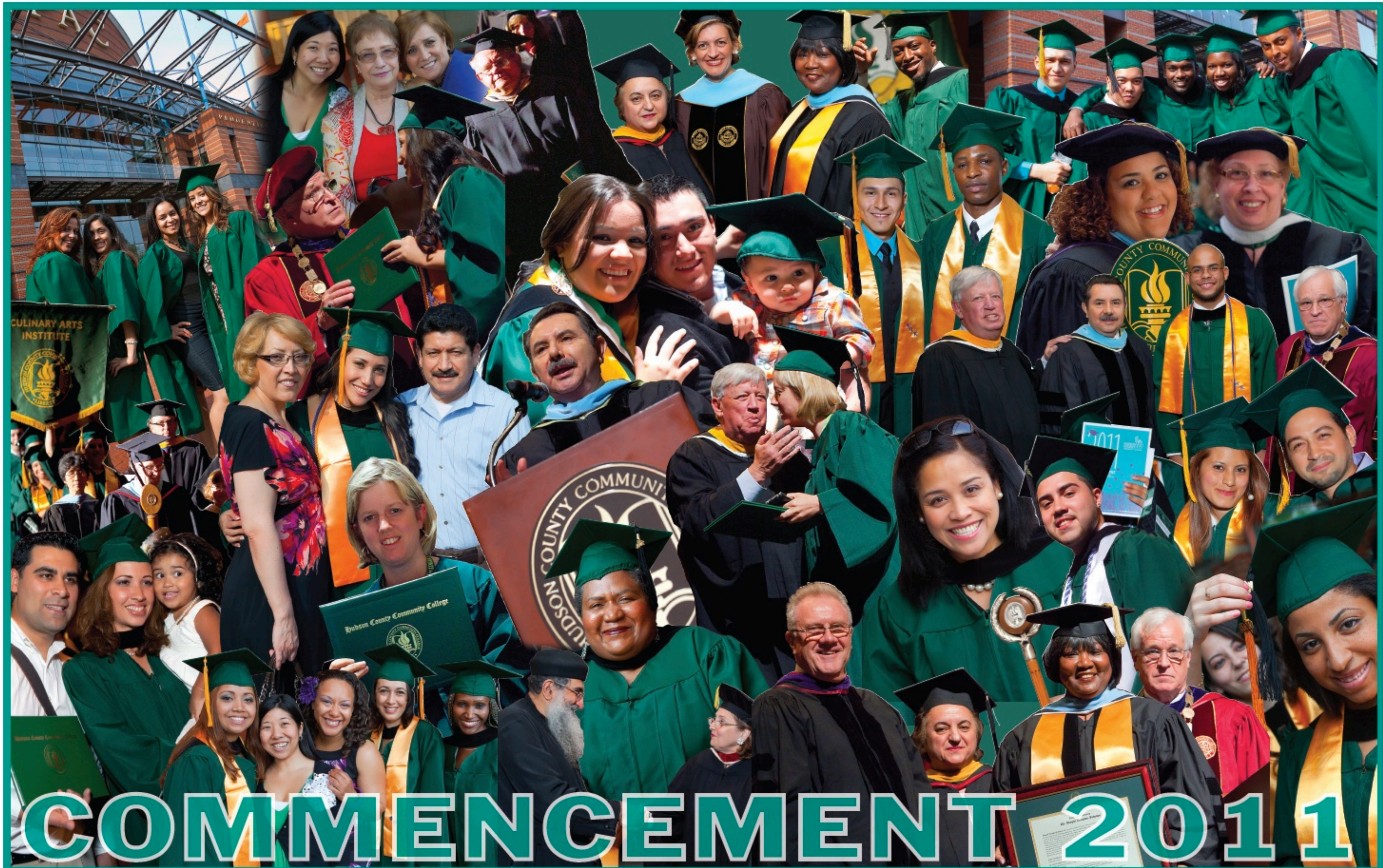
Centerfold Layout by Tara Lyn Dugan, Communications Department