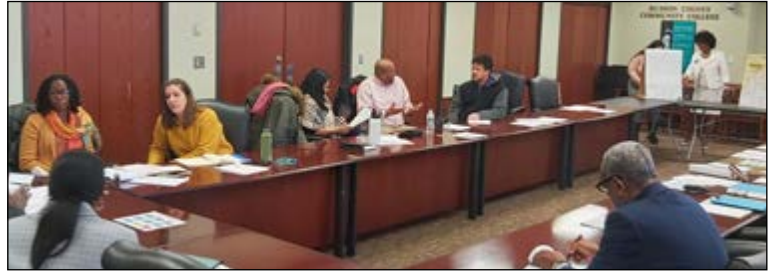
PACDEI members at the December 2019 meeting to discuss data from the survey results and three open forums.