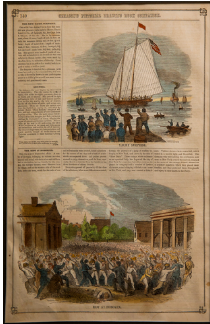
Artist Unknown, "Riot at Hoboken from Gleasons Pictorial" (1851), Hand Colored Etching, 20 x 15.5 in. (framed). This depicts the Elysian Fields where some of the first American baseball games were played. See column at left for more information.

When is it fair to use another person's work without crediting the source? This is a topic that college teachers are quite passionate about. A new