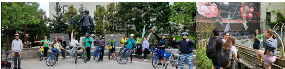
The HCCC Environmental Club Community Garden undertook a Bike Tour in collaboration with BIKE JC, spanning 13 miles, on April 22.