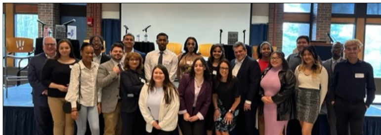
Hudson County Community College at the NJCCC Student and Alumni Spring Convening.

On Saturday, April 15, the New Jersey Council of County Colleges (NJCCC) hosted its first Student and Alumni Spring Convening at Middlesex College in Edison. Hudson County Community College's delegation was the largest presence among the county colleges. Dr.