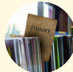
Liberal Arts – History