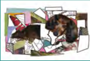
Mickalene Thomas, Portrait de Priscilla la Petite Chienne Deux