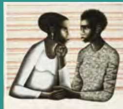
Elizabeth Catlett, Gossip