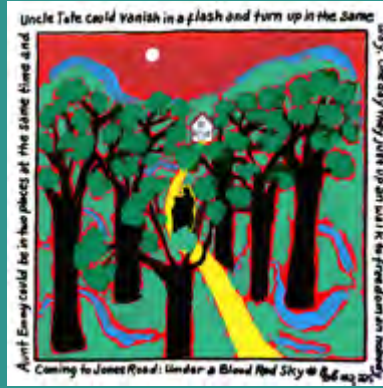
Faith Ringgold, Coming to Jones Road, Under a Blood Red Sky #8