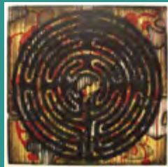
Charles Burwell, Labyrinth #4