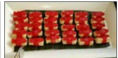
Above photo: Culinary treats depicting “Under the Sea” theme