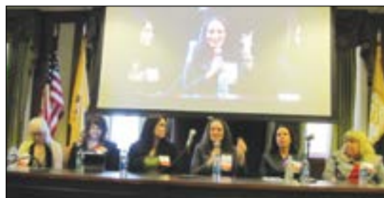
"A Day in The Life of Women in IT" panel discussion.