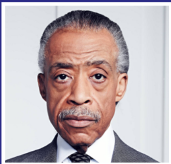
Rev. Al Sharpton

President and Founder, National Action Network (NAN)