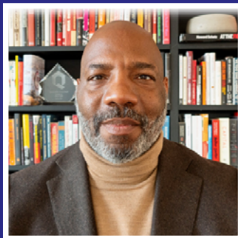
Dr. Jelani Cobb

President and Founder, National Action Network (NAN)