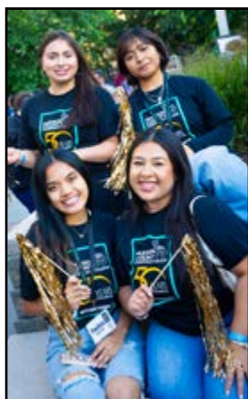
Members of the HCCC community help launch the yearlong celebration at the 50th Anniversary Kickoff event.