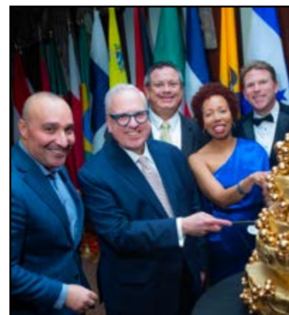
The 28th annual HCCC Foundation Gala generated nearly $250,000 for student scholarships and endowments.