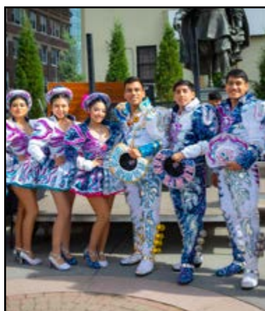
West New York salsa dancers at our first-ever Homecoming Block Party and Open House.