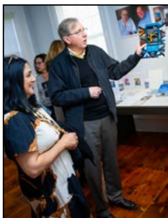
The Fifty Years of Excellence exhibit at the Museum of Jersey City History opened on November 7 and will run through March 7, 2026.