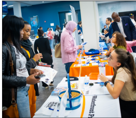
On Wednesday, Oct. 30, Hudson County Community College's Hudson Helps Resource Center held a Resource Fair to connect students with local organizations and their available services.