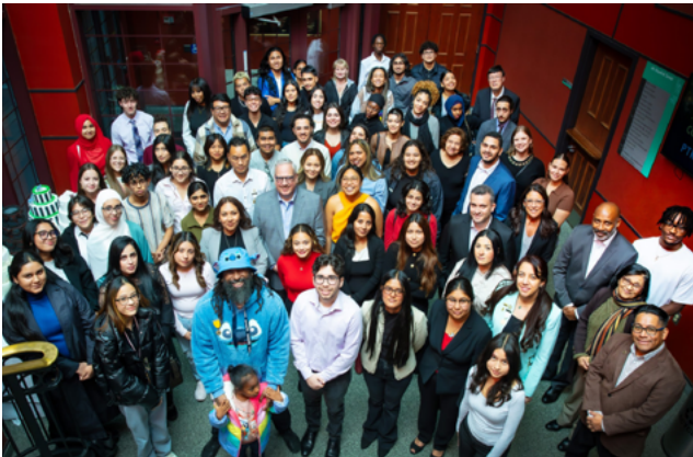
Beta Alpha Phi inducted more than 100 students at its semiannual ceremony on Monday, Oct. 28.