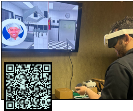
Scenes from the CAT ACCESS Program's Virtual Reality and Simulation Lab soft launch