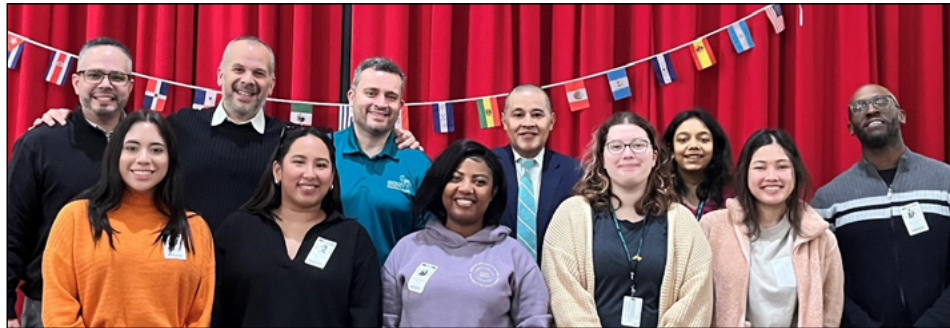
Members of Hudson County Community College's chapter of the American Chemical Society (ACS) served as judges for PS #5 Middle School Science Fair in December.