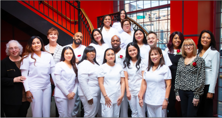
Graduates of the Practical Nursing Program with members of the School of Nursing and Health Professions.

On Wednesday, Dec. 18, 2024, Hudson County Community College's School of Nursing and Health Professions held a pinning ceremony for the graduates of its Practical Nursing Program.