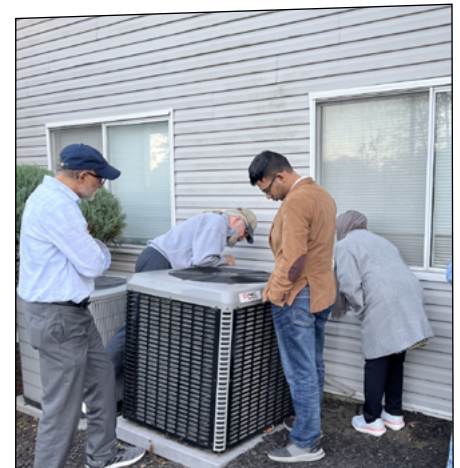
Instructors in the Construction Management program receive training in building performance. Once the instructors are certified, the College's program will be certified as a training and testing center.

Building Performance Institute (BPI) is a leading organization that develops technical standards and certifications for energy efficiency and weatherization professionals in the building performance industry. Center for Construction Management is working to be a recognized Training and Testing Center for the BPI certification exams and is