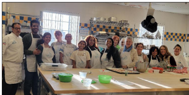
Smiles all around as participants wrap up a hands-on Holiday Cookies & Treats workshop at HCCC