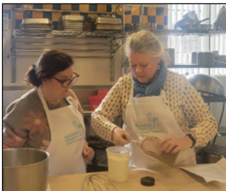
Guests work side-by-side measuring and preparing ingredients as they begin their holiday cookie dough

On December 6, HCCC's CEWD hosted their annual festive and interactive Holiday Cookies & Treats Class. Guests were guided through a hands-on cookie making experience featuring classic seasonal flavors and creative decorating techniques. Attendees explored