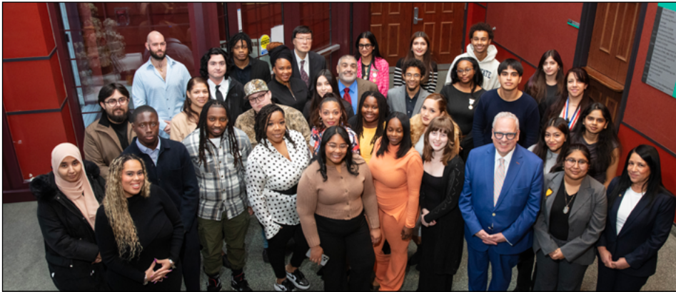
Hudson County Community College celebrated its newest Phi Theta Kappa inductees on Monday, Nov. 24, honoring students for their academic excellence and leadership.