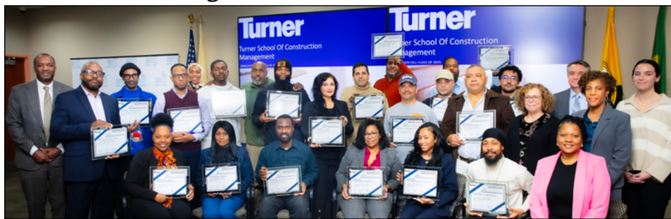
Hudson County Community College and the Jersey City Office of Diversity and Inclusion celebrated the initial cohort of the Turner School of Construction Management Program on Dec. 2.