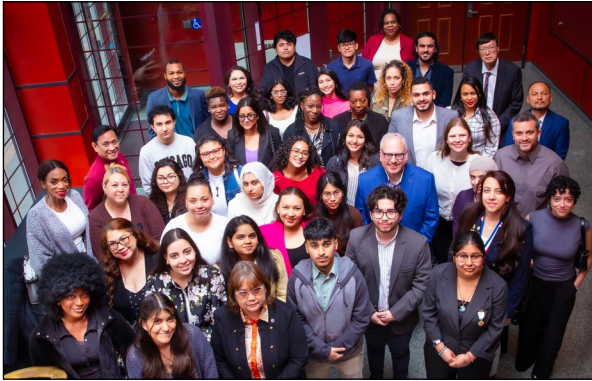
Phi Theta Kappa, Beta Alpha Phi Chapter induction ceremony on April 27th.