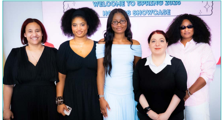
The Honors Program held its semiannual Student Showcase on May 7, featuring Honors students' term projects in a variety of disciplines.

Hudson County Community College (HCCC) invited the entire college community to the Honors Student Showcase on Tuesday, May 7. The signature event celebrated the hard work, research, and academic achievements of students in the HCCC Honors Program.