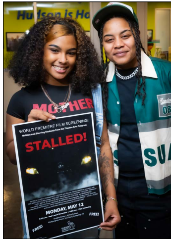
Scenes from the reception and premiere of STALLED!

STALLED! offers a unique look at what happens when ordinary circumstances take an unexpected turn — all within the most unlikely of settings.