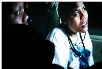
A scene from the film.