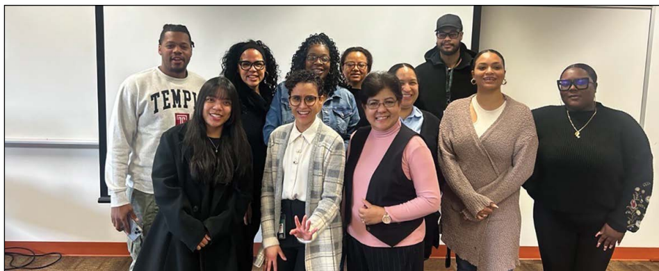
Financial literacy in action—GTI students join M&T Bank for an engaging Money Mentorship session.

For more information, contact: HCCCFilmAcademy@hccc.edu