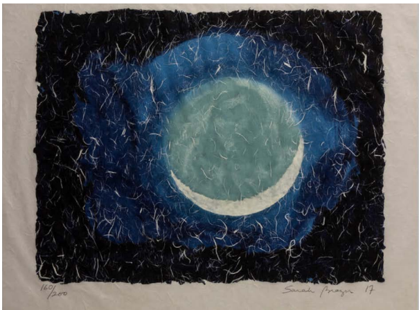
Sarah Brayer, Crescent Glow (2017). Silkscreen and Chine-collé on unryu Mulberry paper with Phosphorescent Pigment, 21" x 26"

Each month, this page in HCCC Happenings provides updates on artists whose works are in the Collection, and new additions to the Collection.