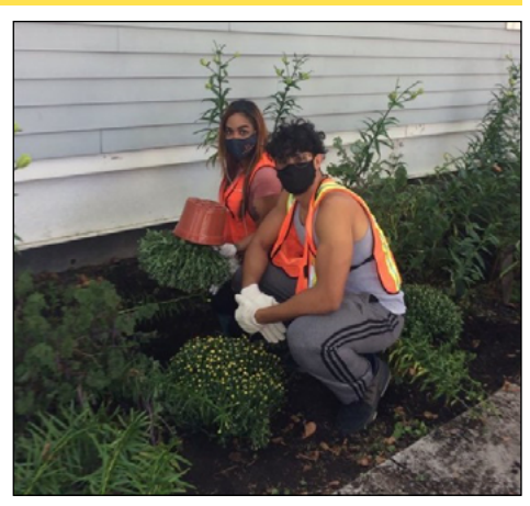
dia volunteering in the gardening program at Liberty State Park on Sept. 5 and Sept. 12.