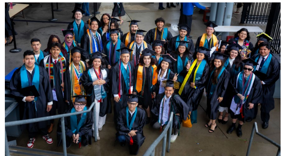
With the support of a $100,000 grant from the Provident Bank Foundation, the Hudson Scholars Program has created significantly improved outcomes for hundreds of HCCC students. Pictured: Hudson Scholars graduates at HCCC's 2024 Commencement.

Launched in 2021, the Hudson Scholars Program received national acclaim when it won the prestigious, nationally competitive 2024 Bellwether Legacy Award a year after winning