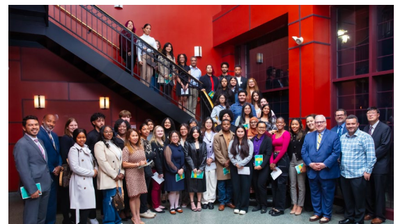
Pictured here: Hudson County Community College faculty, staff and administrators joined more than 130 students who were inducted into Phi Theta Kappa International Honor Society last fall.

For the third year in a row, Hudson County Community College (HCCC) was chosen as a 2024 Great College to Work For® by ModernThink LLC.