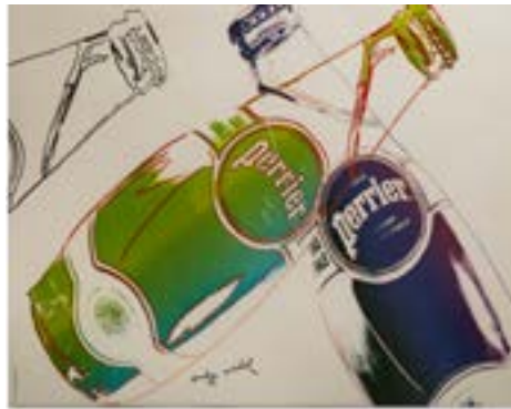
You can see the College's work by Andy Warhol at the Culinary Conference Center, 161 Newkirk Street, Room 218 (Dean's Reception Area). The work, Perrier White , is a 17.5" x 23.5" Offset Lithograph created in 1983. It was acquired from the artist's estate.

Each month, this page in HCCC Happenings provides updates on artists whose works are in the Collection, and new additions to the Collection.