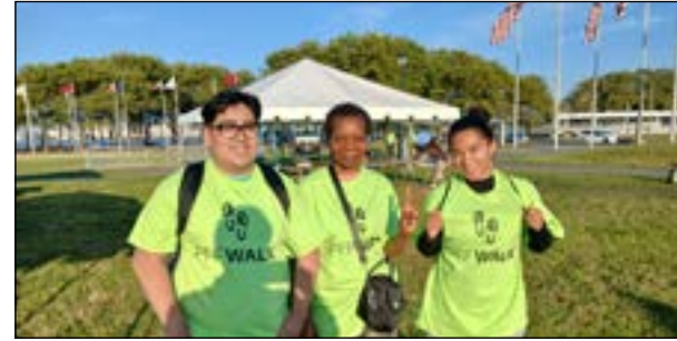
Beta Alpha Phi participated in the Pulmonary Fibrosis Foundation Walk on Aug. 2.