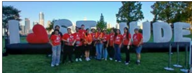
The Beta Alpha Phi team serving and walking at the St. Jude in New York City.